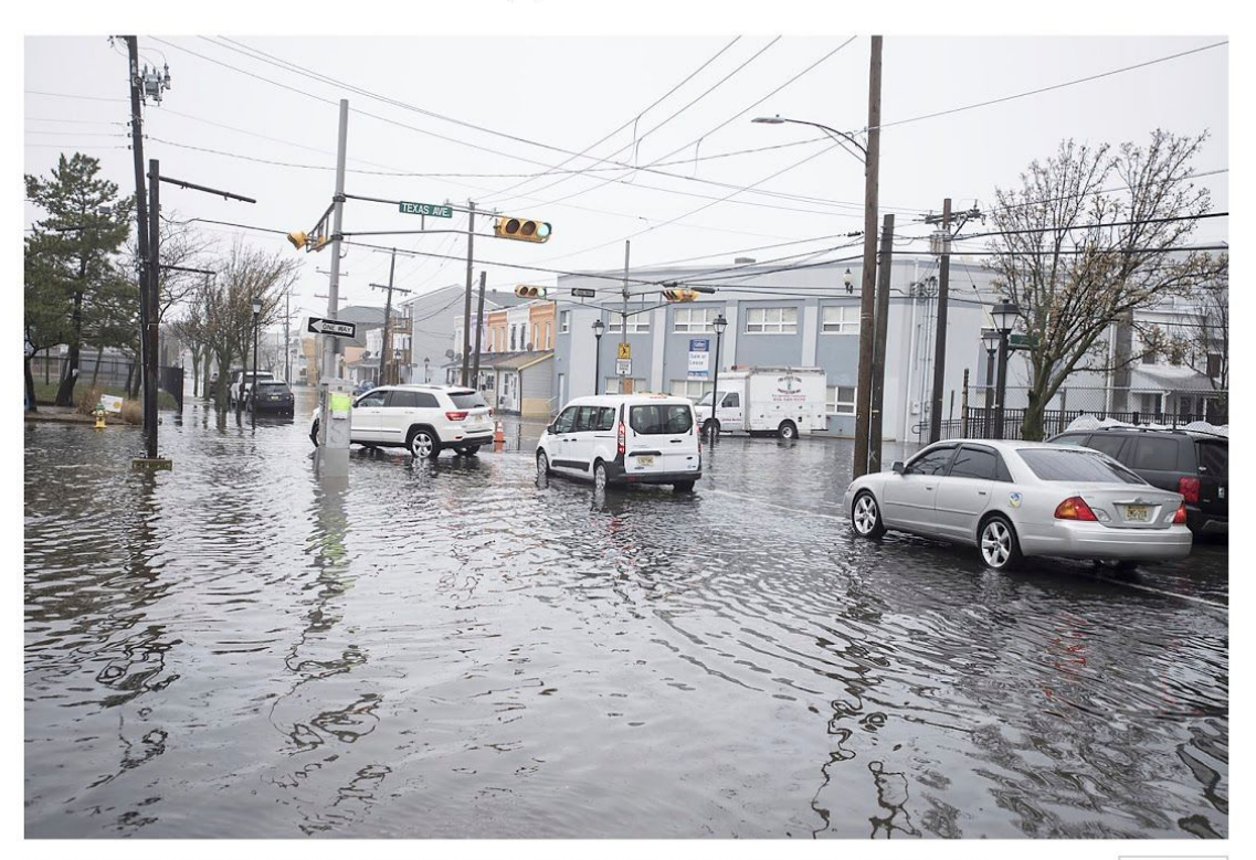
On April 16th 2018, Heavy rain caused flooding in Atlantic City. Images Texas Ave and Artic Ave.

MICHELLE BRUNETTI POST Staff Writer May 1, 2018